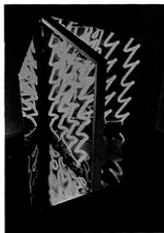
ROBERT SMITHSON THE ELIMINATOR 1964

The Eliminator overloads the eye whenever the red neon flashes on, and in so doing diminishes the viewer’s memory dependencies or traces. Memory vanishes, while looking at The Eliminator . The viewer doesn’t know what he [sic] is looking at, because he has no surface space to fixate on: thus he becomes aware of the emptiness of his own sight or sees through his sight.